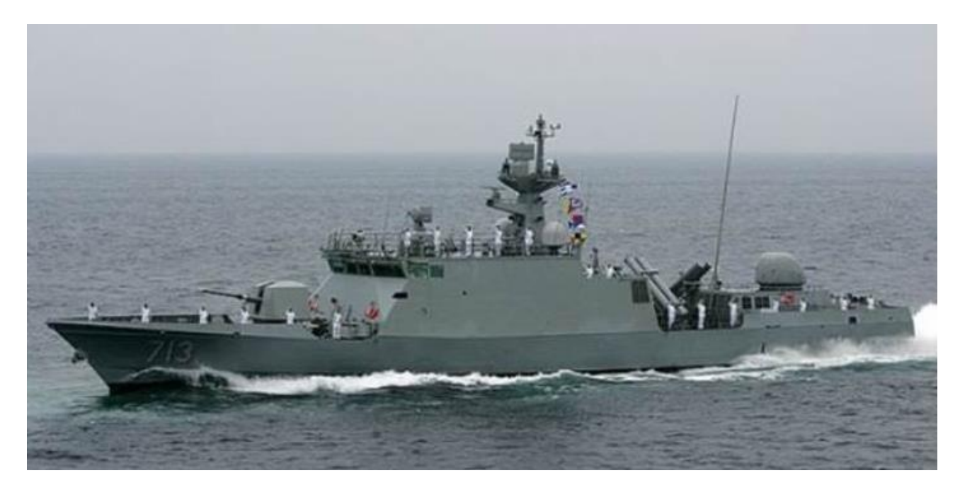
Fig. 3 - Azmat class Pakistani battleship

The lure document is asking for the payment related to the repair of board radars for the two following ships which belong to Pakistan Navy classes called Azmat and Dehshat.